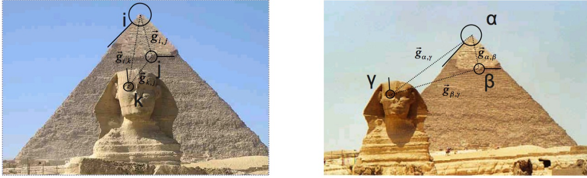
Figure 2: Representation of images as labeled graphs. Shown are three exemplary interest points for each image. The number of interest points detected is content dependent but is on the order of several hundred for 640x480 resolution images with content as shown. Each interest point is assigned a position, scale, and orientation [Low99]. In the figure the scale is indicated by a circle and the orientation by a pointer. This information can be used to characterize the relative pose and position of two interest points denoted by the vectors \vec{g} next to the dotted lines.

still expect that neighboring features tend to move in a similar way. Thus image matching can be cast as an optimization problem in which one attempts to minimize an objective function that consists of two terms. The first term penalizes mismatches between features drawn from image one and placed at corresponding locations in image two. The second term enforces spatial consistency between neighboring matches by measuring the divergence between them. It has been shown that this constitutes an NP-hard optimization problem [FH05].